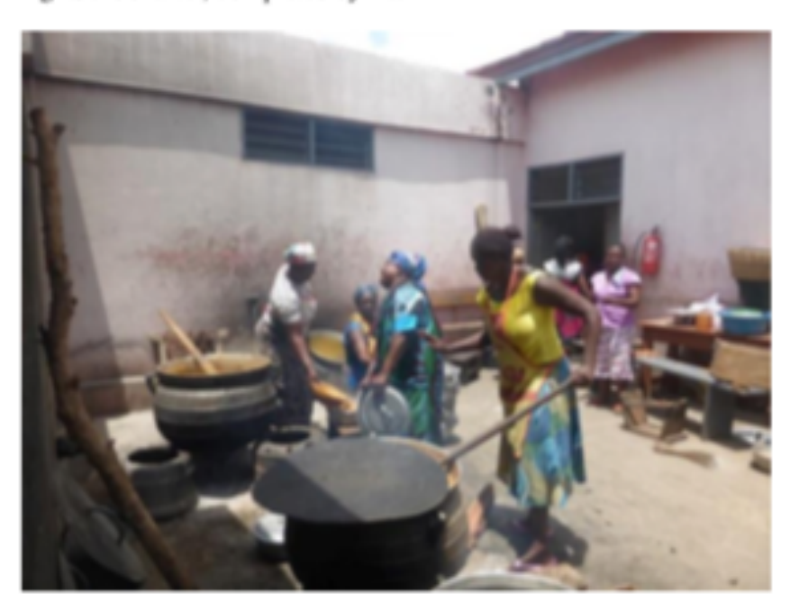
This is Bongo Senior High School Kitchen