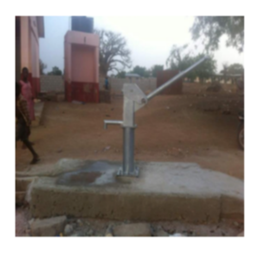
This is Senior High School after, completed by LWA