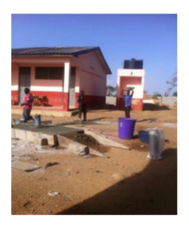
This borehole is drilled by project Bongo and completed by LWA